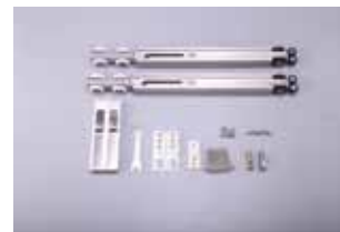
Heavy Duty Hanging Door Damper 重型吊門緩衝器