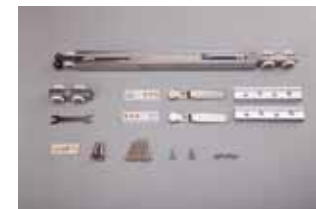
Medium Duty Hanging Door Damper 中型吊門緩衝器